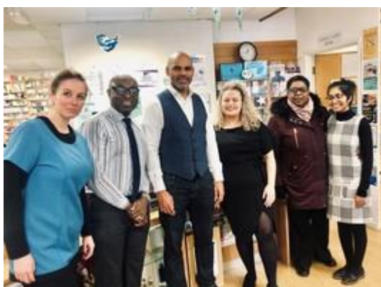
Bedminster HLP team share their experience how community pharmacy can make this a reality

As a Healthy Living Pharmacy, the Bedminster Pharmacy team know that we have a crucial role to play supporting the health and wellbeing of our patients by working proactively with other health, social and